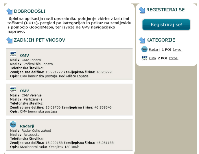
Figure 3: Web application basic (intro) page.

Table UPORABNIKI (Users) contains records of all registered users. Foreign key field Status is linked via an id number to table STATUSI (Status) which stores information on user types. Presently only two types of users are planned: a regular user and an editor. The users table is also linked to tables POIS and KATEGORIJE (Categories) via foreign keys, which enables us to retrieve any information about users and their activities.